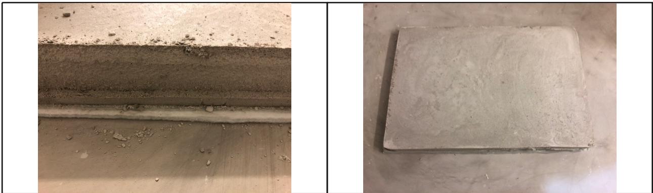
Illustration / drawing for sample assembly

Remark: Test on a small sample area (~ 1,2 m x 0,8 m).